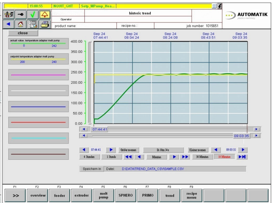
Process variables – current trend and history

Automatik Plastics Machinery GmbH Ostring 19 · 63762 Grossostheim · Germany T +49 6026 503 0 · F +49 6026 503 109 info@automatikgroup.com · www.automatikgroup.com