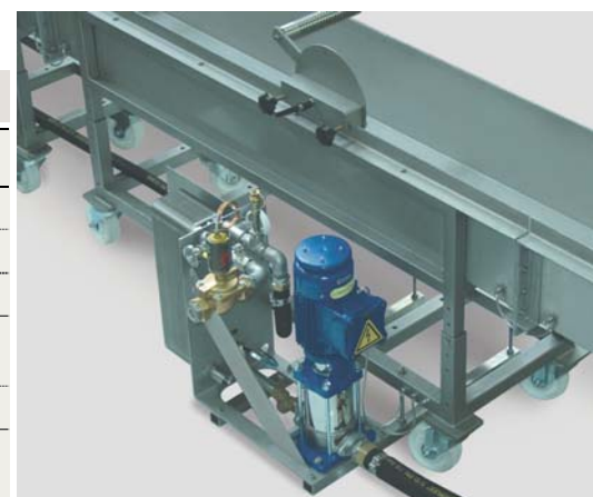
PWA integrated into the frame of cooling trough