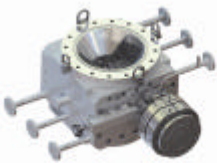
Maag vacorex® gear pump for the polymer industry