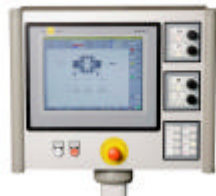
Maag maax 62 control system for complete production lines