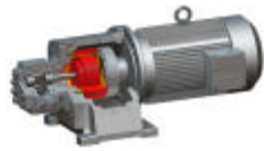
Maag 316 cinox® magdri- ve (with heatable magne- tic coupling)