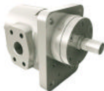
Maag refinex® gear pump for non-corrosive applications