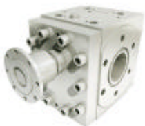
Maag extrex® gear pump for the extrusion industry, including dri- ve and adapting flanges