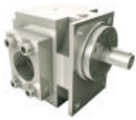
Maag 316 cinox® / thermi- nox® gear pump for the chemical industry