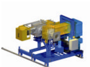
Delivery from one hand: Maag screen changer, gear pump and drive unit