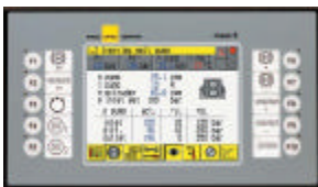
Maag maax 9 control system for extruders